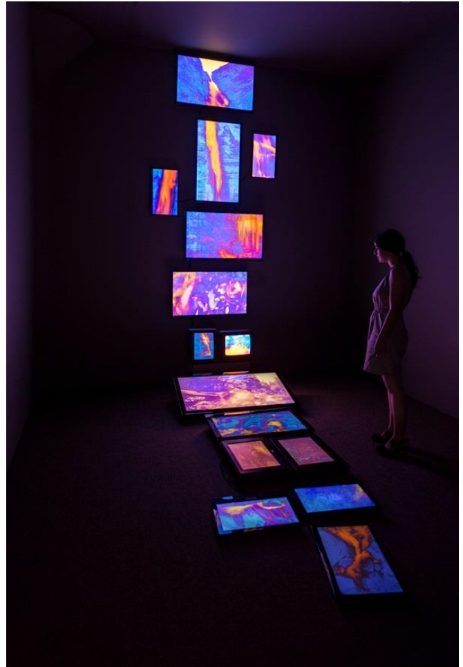
Kevin Cooley Fallen Water (2015), Fifteen-channel video installation, dimensions variable.

Miami Beach, FL: Celebrating Miami Project's venue change to The Deauville on Miami Beach, Catharine Clark Gallery presents a curation of water-themed work across disciplines and media. Inspired by W.H. Auden's artistic commentary, On the Sea & the Mirror showcases several artists' work which reference water, and depictions of its various forms, as landscape, backdrop, protagonist, political statement, context for humor, formal device, art historical riff, and break from more apocalyptic topics. Situated between the ocean-swept beauty of the Pacific Coast and the drought-plagued American West, Catharine Clark Gallery's artist program reflects the nexus