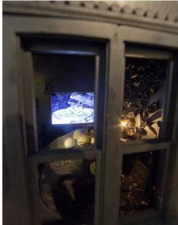
Video of Night Hunter viewed through the windows of Night Hunter House

Night Hunter (2011), Steers’ most noted work and the namesake of the exhibition, incorporates images of Lillian Gish taken from silent-era, live-action cinema. The narrative unfolds intuitively, and reveals itself in the process of construction. To produce the film, Steers generated over 4,000 paper collages which combine fragments of 19 th century illustrations with images from four silent-era moving pictures. Steers’ process is painstaking and meticulous— Night Hunter took over four years to make, with approximately eight collages required to produce a single second of film time. In some instances, Gish is cut out of specific scenes and reconfigured in collage environments, while collage materials are applied directly to printed film frames in others. The subsequent fluidity becomes a critical element in the texture of the film, and the identity of the principal character. Transitions, both biological and metaphorical, are central themes. The collages were photographed in 35mm on an Oxberry animation stand. Larry Polansky composed the music and sound elements.