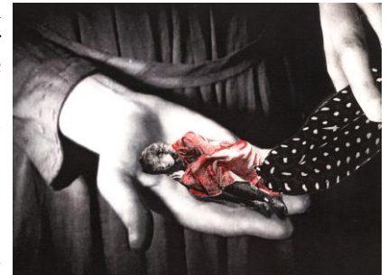
Scene from the film Night Hunter

Several of the most evocative mixed-media collages, selected from thousands produced for both films, will also be featured in this exhibit. These beautiful stills, stand-alone pieces of art in their own right, are critical to the subsequent fluidity and texture of Steers' films. Animation Sketchbooks , by Laura Heit, published in July 2013 by Chronicle books, includes Steers' artwork, and features her as one of fifty leading contemporary talents working in independent animation. Copies of the book will be on display and available for purchase at the exhibition.