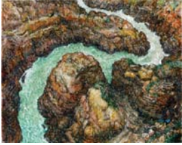
Dead End at Devil's Bend, 2011 Oil on panel 8 x 10 inches