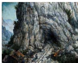
Natural Law , 2012 Oil on linen 18 x 22 inches

November 3 – December 22, 2012 Extended through January 12, 2013