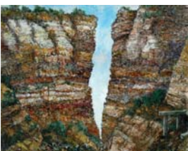
The Split (From Miner's Neck) , 2011 Oil on panel 8 x 10 inches