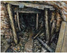
Entrance to the Mother of God Mine, 2011 Oil on panel 8 x 10 inches