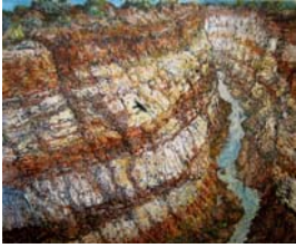
As The Raven Flies, 2011 Oil on panel 8 x 10 inches