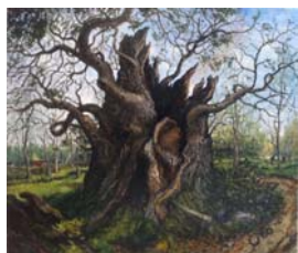
The Old Man of Calke , 2012 Oil on linen 77 x 90 inches