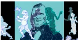
Erin Cosgrove In Defense of Ghosts, 2011 Live action and animated video Edition of 5 + 2 APs 13:20 minutes