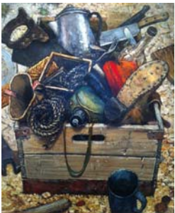
The Legacy of Henry King, 2012 Oil on linen 56 x 46 inches