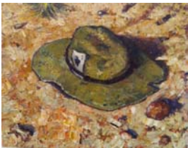
Old Hat , 2012 Oil on panel 8 x 10 inches