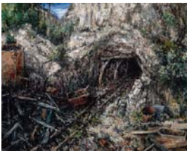
The Remains of the Rattlesnake Mine, 2011 Oil on panel 8 x 10 inches