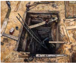
Small Time Operation , 2012 Oil on linen 46 x 56 inches