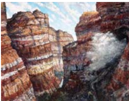
Blasting , 2012 Oil on linen 20 x 24 inches