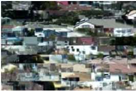
Anthony Discenza Drift, 2003 Single channel video Edition of 3 + 2AP 15:00 minutes

Please see plaque in video room for screening schedule