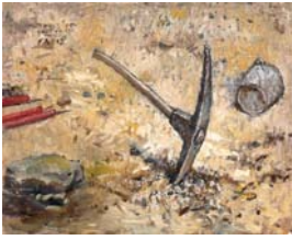
Tools of The Trade , 2012 Oil on panel 8 x 10 inches