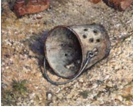
Shot Bucket, 2012 Oil on linen 18 x 22 inches