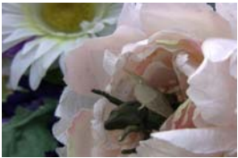
Lauren Kelley True Falsetto, 2011 Edition of 6 2 min 16 sec Single channel video