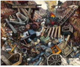
The Dump At Shit Creek, 2012 Oil on linen 18 x 22 inches