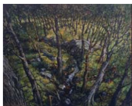
Upper Shit Creek Pastoral , 2012 Oil on linen 18 x 22 inches