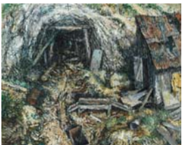
Trouble at the Heavenly Host Mine, 2011 Oil on panel 8 x 10 inches