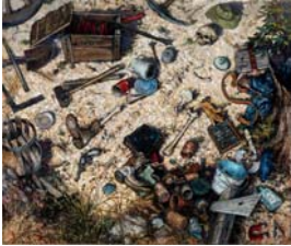
A Game of Bones , 2012 Oil on linen 78 x 94 inches