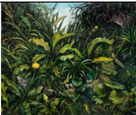
Evidence , 2011 Oil on linen 78 x 94 inches