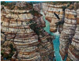
Grubstake, 2008 Oil on linen 78 x 94 inches