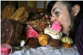
Aideen Barry Possession, 2011 Edition of 50 6: 30 minutes Single channel video