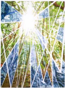
Refracture , 2012 Watercolor on paper 68 x 46 inches unframed 70 x 48 inches framed $ 14,000 framed