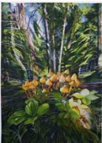
Mycelium Magneticus , 2012 Watercolor on paper 68 x 46 inches unframed 71 x 49 inches framed $ 14,000 framed