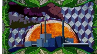
Smokescreen , 2010 Duratrans on LED light-box Edition of 5 + 2 AP; Edition 2/5 14 x 24 ½ inches framed $ 5,000