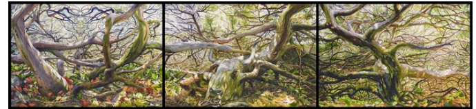
↳ The Larger Illusion , 2012 Duratrans on LED light box triptych Edition of 5 + 2 AP; Edition 1/5 20 x 90 inches $ 18,000