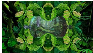
Waste_Generation , 2011 (Media Room) Single-channel video: digital animation, Mac Mini Sound design by Joe Arcidiacono Edition of 5 + 2 AP; Edition 2/5 6:28 minutes, continuous loop [Click to view video clip] $ 18,000