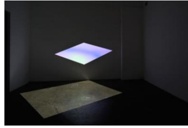
Idyllwild , 2012 Two-channel projected generative animation, Mac Mini, speakers Music by Garth Stevenson Music produced by Joe Arcidiacono Thanks to Shahar Zaks and Nicholas Rubin Edition of 3 + 2 AP; Edition 1/3 Dimensions variable [Click to view video clip] $ 20,000