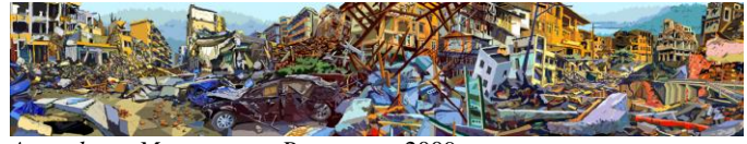
Apocalypse Management Panorama , 2009 Duratrans on LED light box Edition of 5 + 2 AP; AP 1 12 x 60 inches $ 12,000