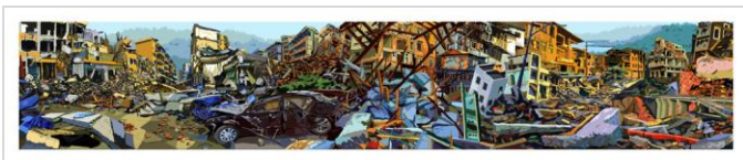
Apocalypse Management Panorama III , 2010 Archival inkjet print Edition of 20 + 2AP 10 ¾ x 48 inches unframed $ 1,500 unframed