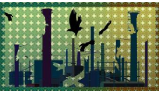
Bird Void , 2010 Duratrans on LED light-box Edition of 5 + 2 AP; Edition 1/5 14 x 24 ½ inches framed $ 5,000