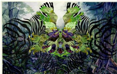
Masque , 2012 Watercolor on paper 46 x 68 inches unframed $ 12,000 unframed