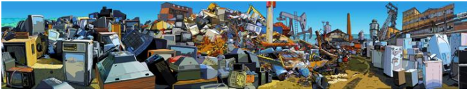
History of the 20th Century , 2010 Duratrans on LED light box Edition of 5 + 2 AP; Edition 3/5 11 ½ x 60 ¼ inches $ 9,500