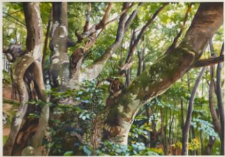
Three Witches , 2012 Watercolor on paper 46 x 68 inches unframed 49 x 71 inches framed $ 14,000 framed