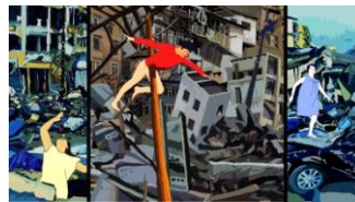
Apocalypse Management (telling about being one being living) , 2009 Single-channel video: digital animation, Mac Mini Sound design by Joe Arcidiacono Edition of 5 + 2 AP; Edition 3/5 5:33 minutes, continuous loop [Click to view video clip] $ 18,000