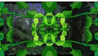
Green/Green , 2010 Duratrans on LED light-box Edition of 5 + 2 AP; Edition 1/5 14 x 24 ½ inches framed $ 5,000