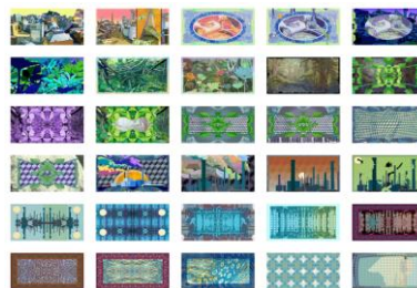
Currency #1-30 , 2011 Archival inkjet prints Editions of 20 3 ½ x 6 ½ each $ 100 each