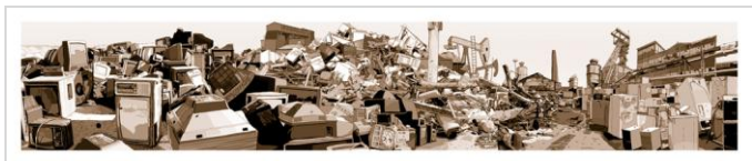
History of the 20th Century II , 2010 Archival inkjet print Edition of 20 + 2AP 10 ¾ x 48 inches unframed $ 1,500 unframed