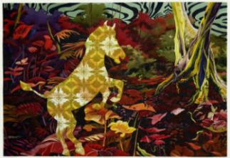
Zebra , 2011 Watercolor on paper 46 x 68 inches unframed 49 x 71 inches framed $ 14,000 framed