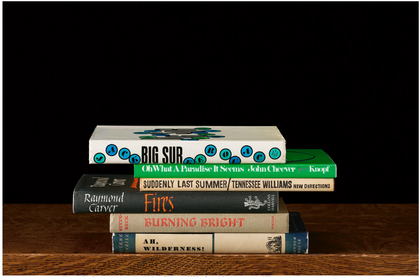
Above: Big Sur in the series "Look Who's Talking," 2022 ("Sorted Books" project, 1993 — ongoing)

248 Utah Street SF, CA 94103 + 415 399 1439 cclarkgallery.com