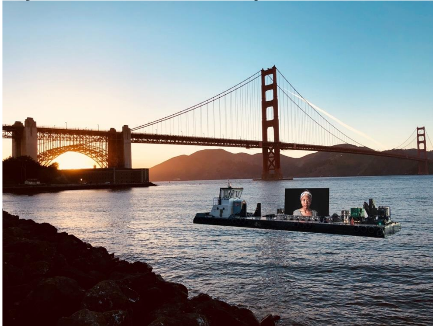
Shimon Attie, Night Watch (rendering on SF Bay).

The Bay Area's First 2021 Multi-City Art + Social Justice Event