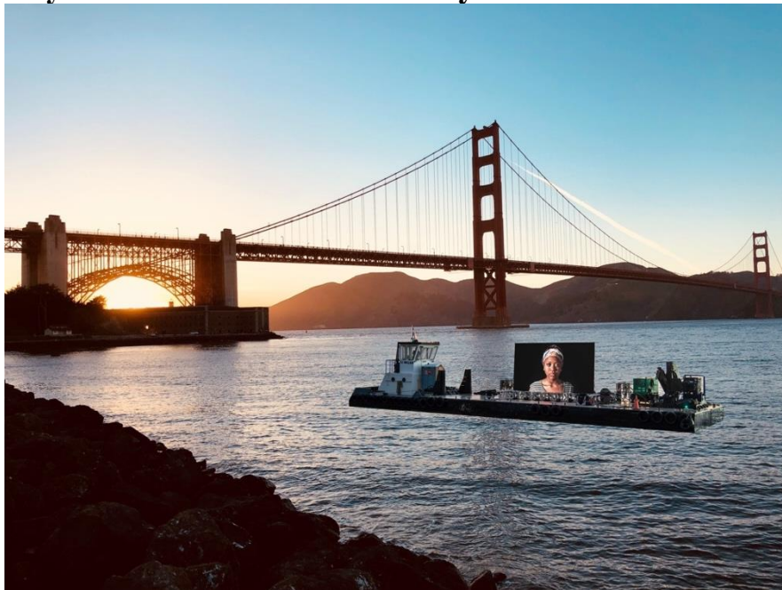
Shimon Attie, Night Watch (rendering on SF Bay).

The Bay Area's First 2021 Multi-City Art + Social Justice Event