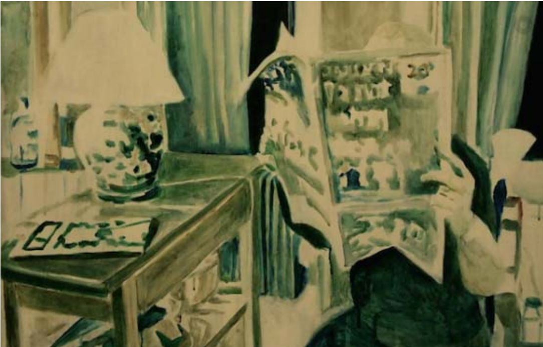
Yayoi Asoma; Kitchen