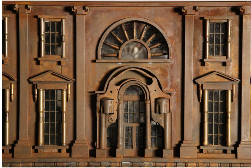
Al Farrow, " The White House " (2018); guns, gun parts, shell casings, and steel; 69 x 77 x 36 in. Detail.

It's the best Farrow piece I have seen. I grant that the religious structures are seductive. A large bullet might suggest a steeple or a minaret, and sacred spaces have certainly been too often in the crosshairs of intolerance.