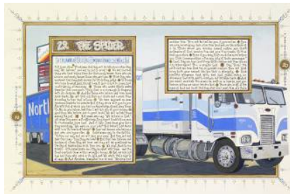
image: Sandow Birk, American Qur'an Sura 29 (a) , 2010, Courtesy of P.P.O.W Gallery, NY and Catharine Clark Gallery, San Francisco