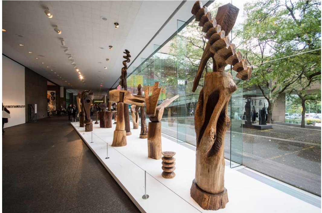
Thaddeus Mosley wood sculptures bridge indoors and out