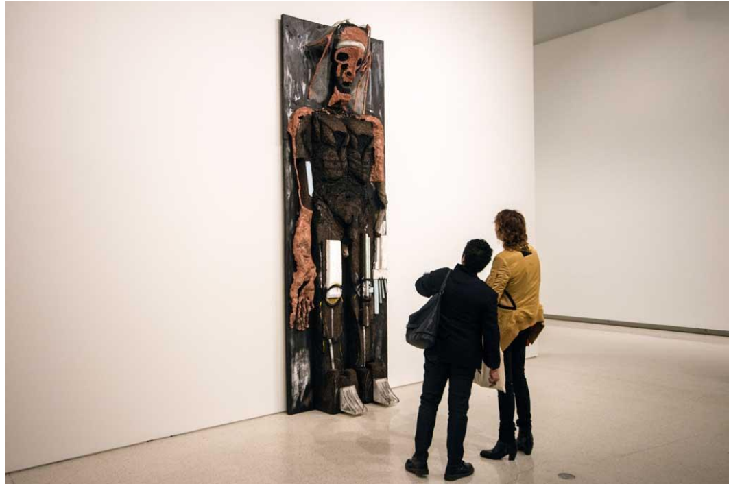
Huma Bhabha cork styrofoam, wood, awesome presence