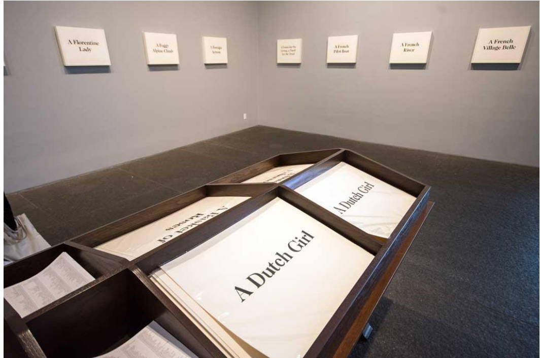
Lenka Clayton & Jon Rubin 10,632 rejected titles