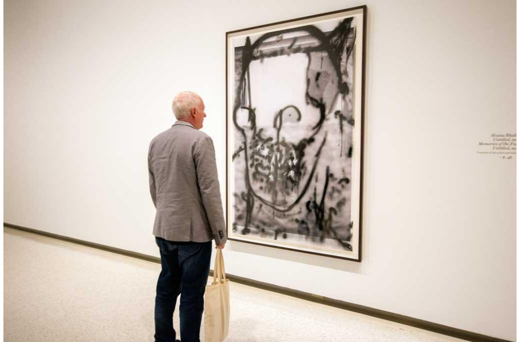
Huma Bhabha untitled