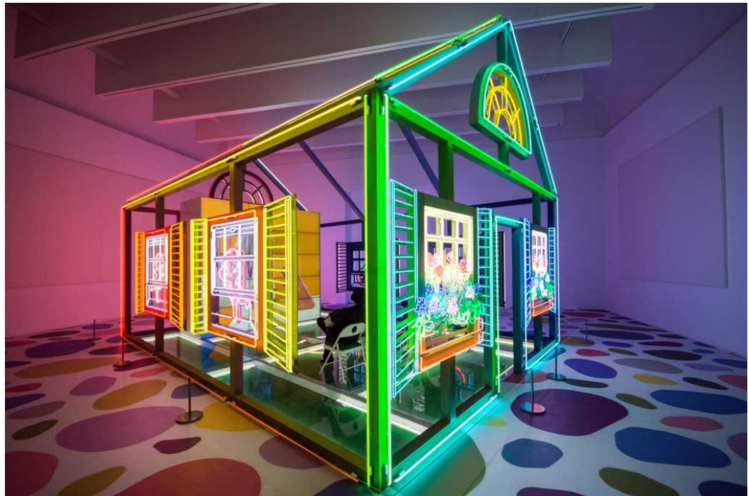
Alex Da Corte's Neon House