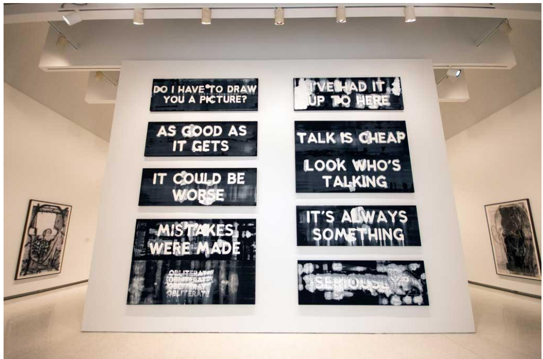
Mel Bochner Do I have to draw you a picture?