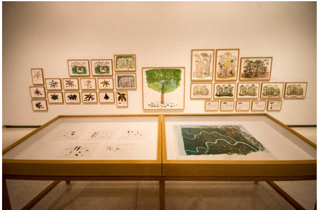
Abel Rodriguez namer of plants draws rain forest he knows