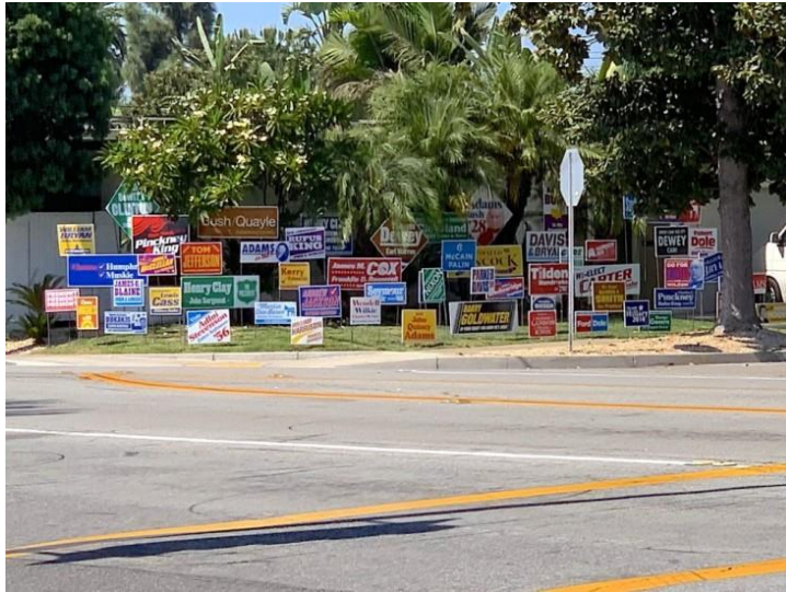
Nina Katchadourian, Monument to the Unelected (2008–) at the the Grand Central Art Center, Orange, California, 2020.