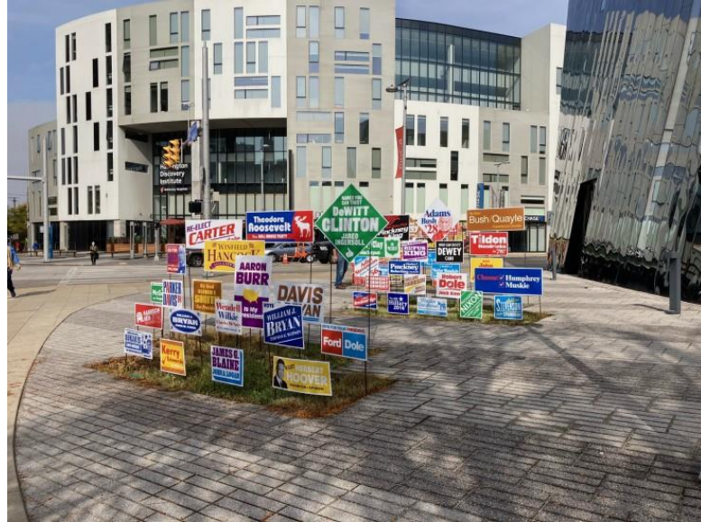
Nina Katchadourian, Monument to the Unelected (2008–) at moCa Cleveland, 2020.