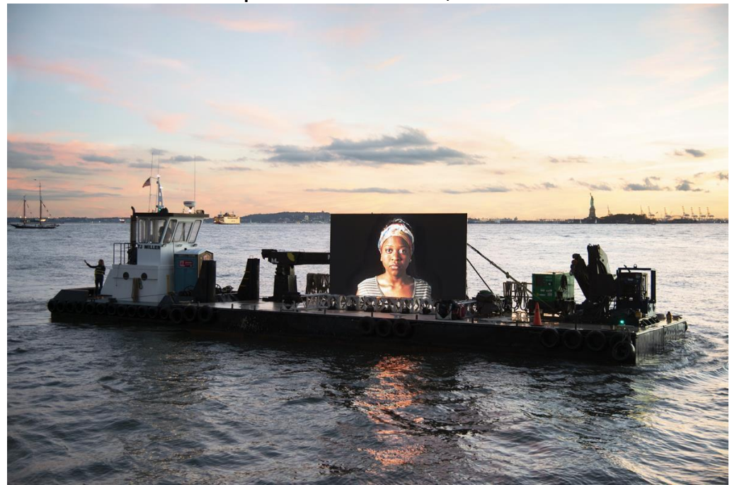
Shimon Attie, Night Watch (Norris with Liberty), 2018. Originally produced by Moreart.org in New York City.

"For the millions who have been forced to flee their homelands to escape violence and discrimination. For the fortunate few who have been granted political asylum in the United States." — Shimon Attie