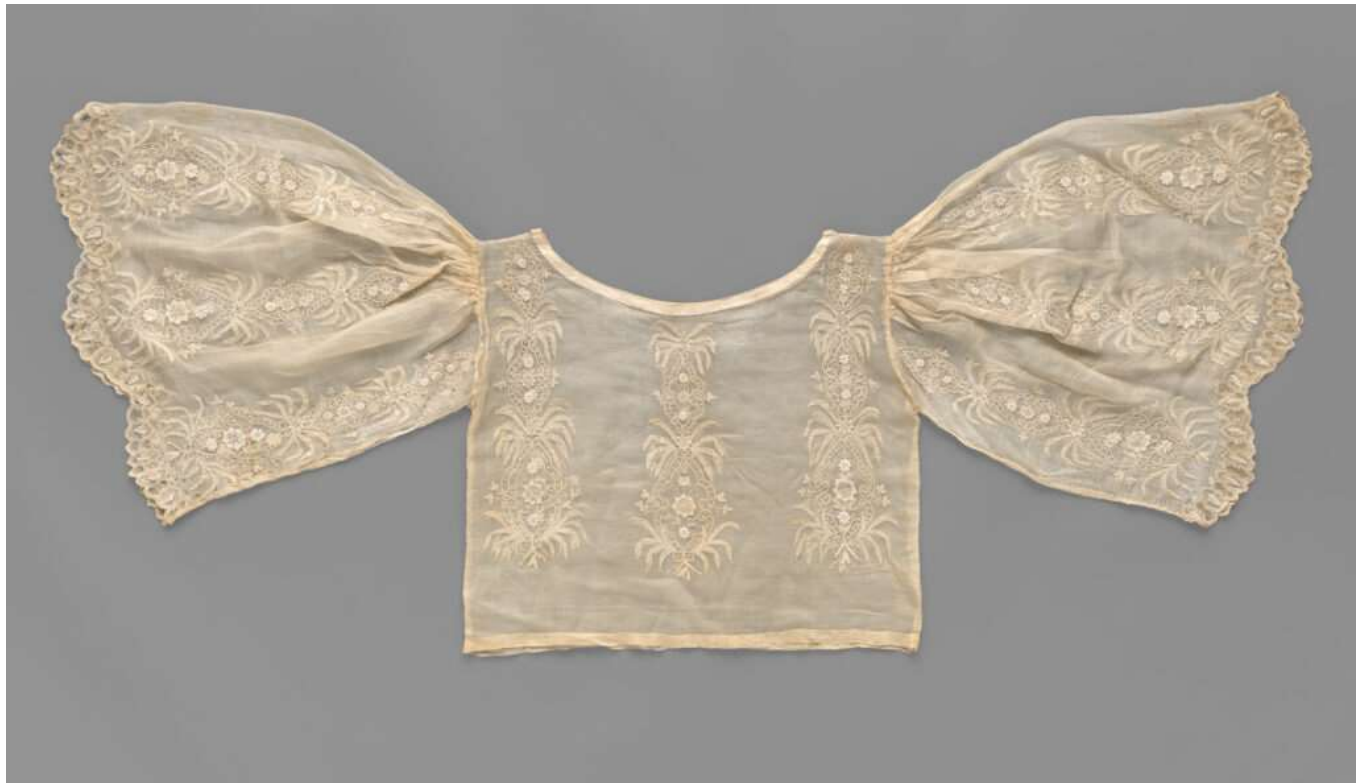
Woman's blouse, Philippines, Luzon Island.

9 a.m.-10 p.m. Monday-Sunday. Opens Nov. 22., tickets on sale through Jan. 3. $29.99-$39.99. Palace of Fine Arts, 3601 Lyon St., S.F. banksyexhibit.com