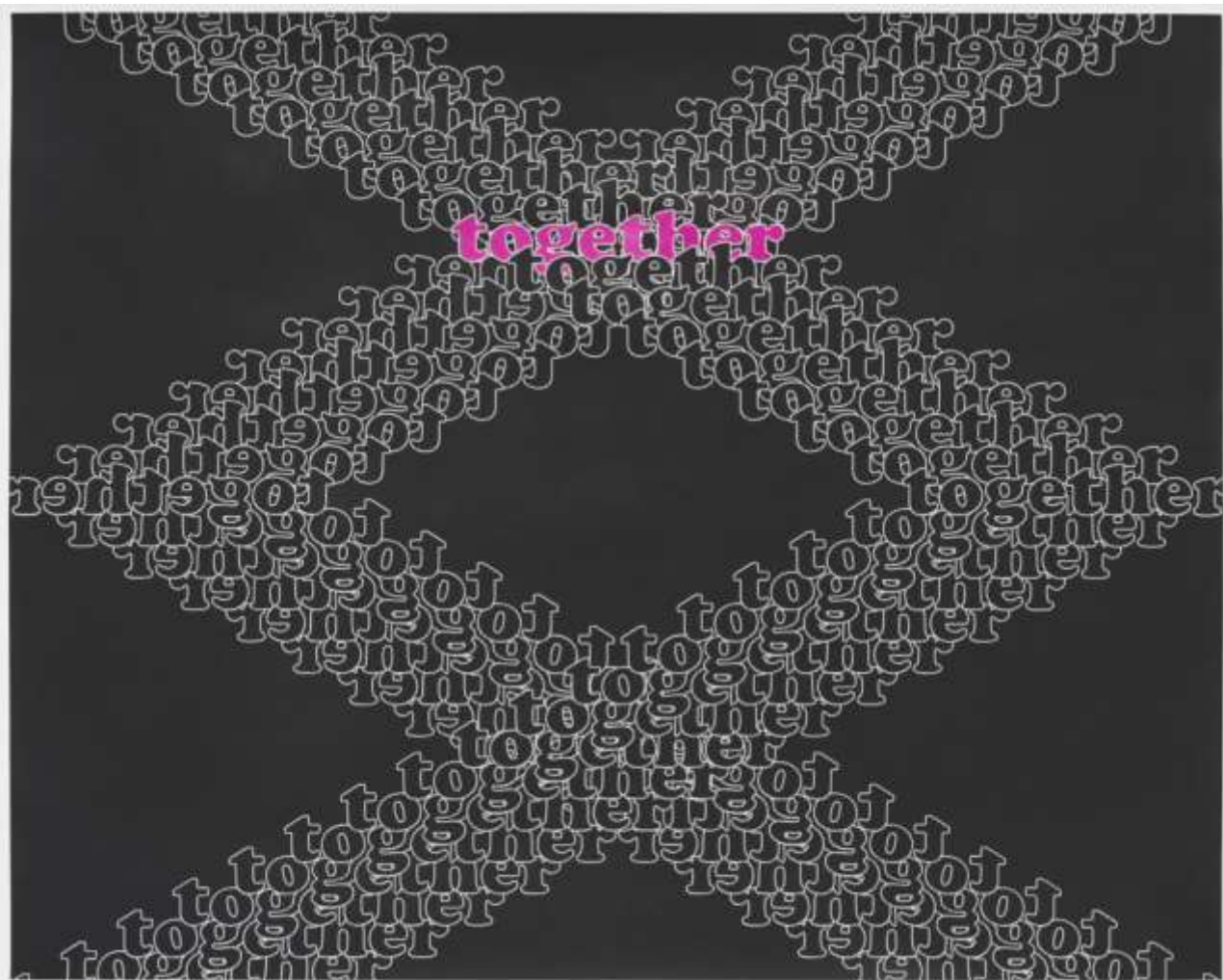
Sadie Barnette, "Together 3," 2021.