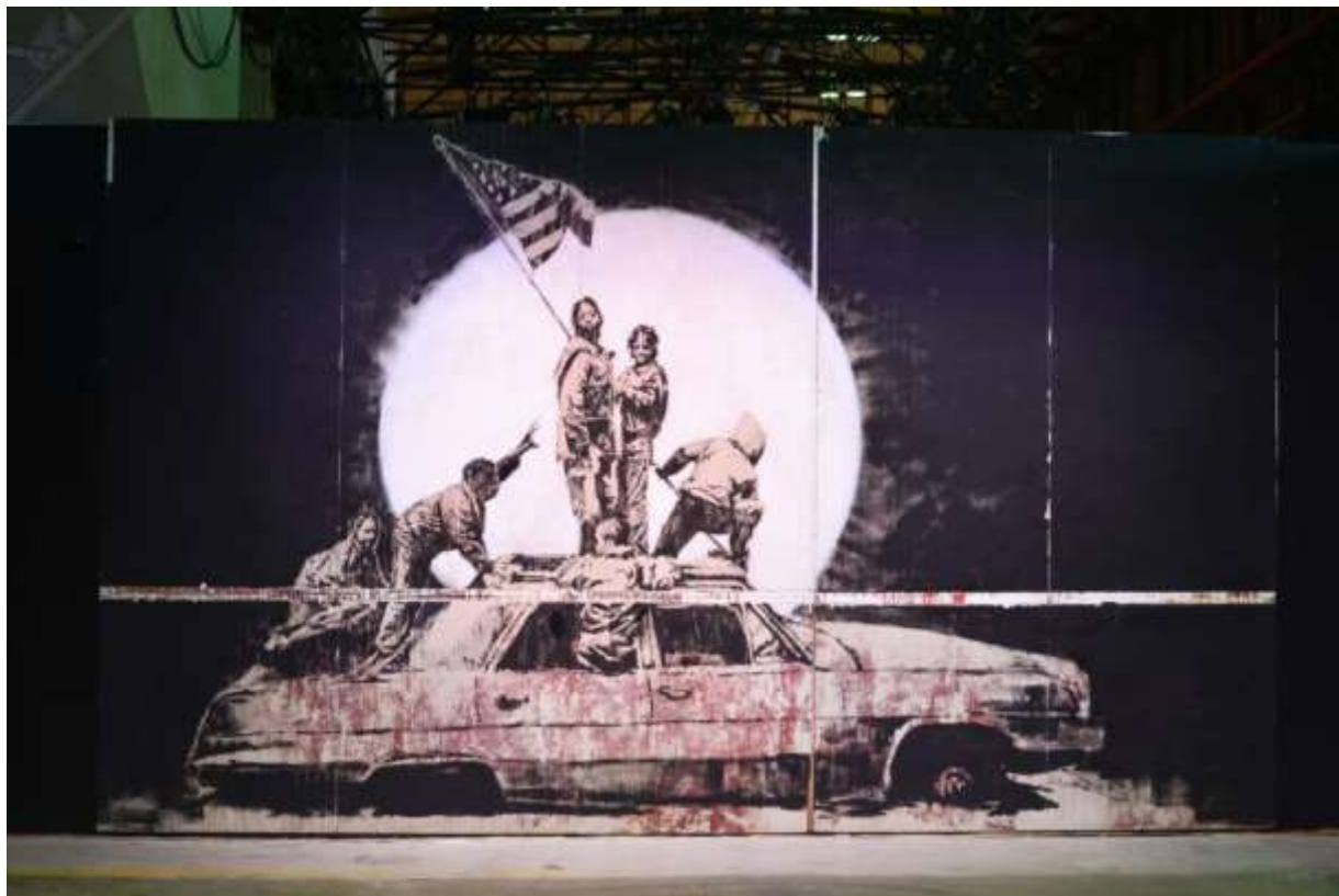
“Flag Wall” by Banksy is seen at “The Art of Banksy” in Toronto.

10 a.m.-6 p.m. Tuesday-Saturday. Nov. 20- Jan. 8. Free. Jessica Silverman, 621 Grant Ave., S.F. 415-255-9508. jessicasilvermangallery.com