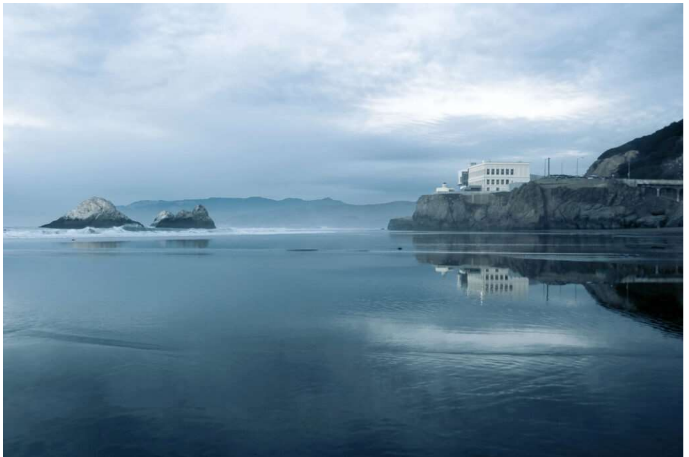
The former Cliff House, San Francisco.

11 a.m.- 4 p.m. Tuesday-Saturday or by appointment. Through Dec. 11. Free. Telematic Media Arts, 323 10th St. S.F. 415-336-2349 https://www.tttelematicccc.com/