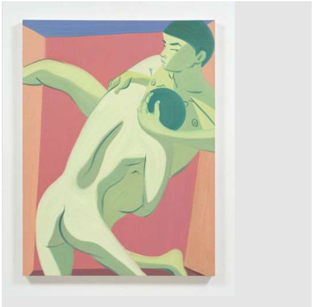
Mark Yang Hip Throw, 2019 Steve Turner $5,500 - 6,500