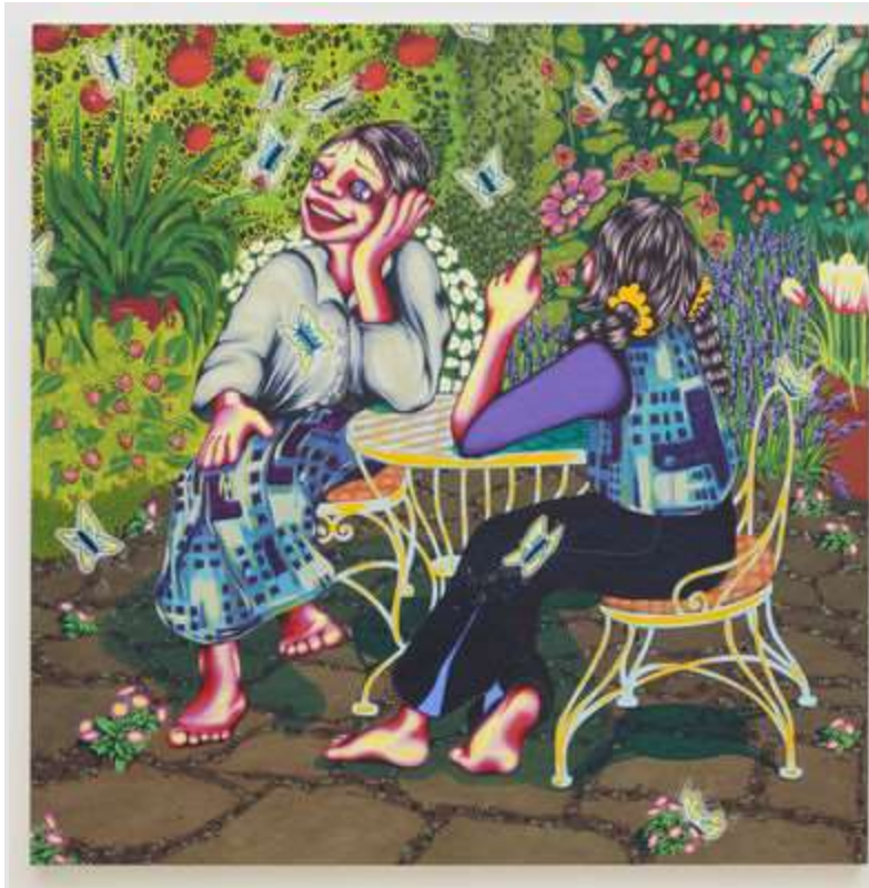
Zoé Blue M. The Gatekeepers, 2021 Anat Ebgi Contact for price