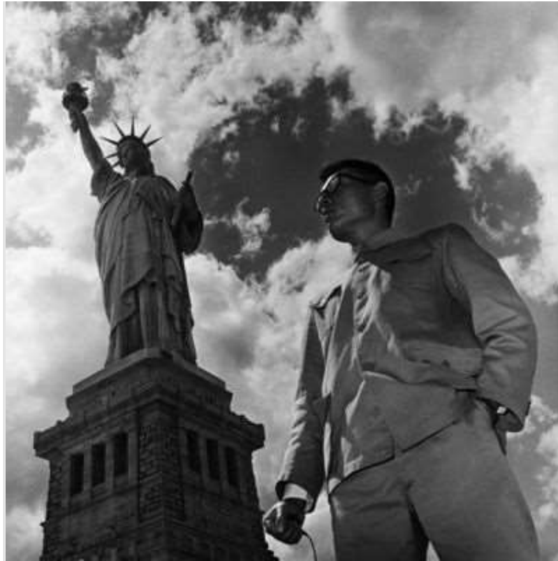
Tseng Kwong Chi New York, New York, 1979 Yancey Richardson Gallery $10,000 - 15,000