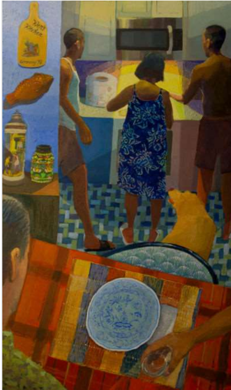
Mikey Yates Merienda, 2020 Taymour Grahne Projects Contact for price