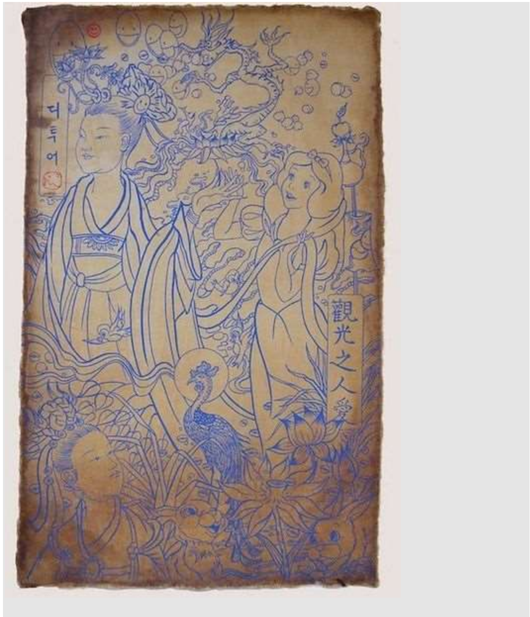
Jiha Moon Procession - Detourist, 2012 Toshkova Fine Art Advisory $1,500