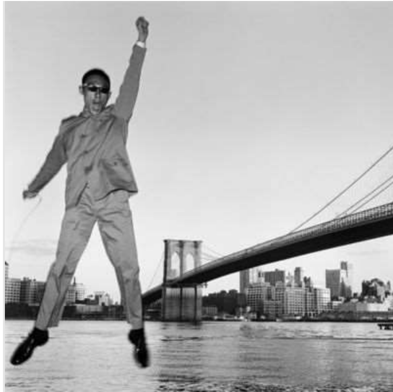
Tseng Kwong Chi New York, New York, 1979 Yancey Richardson Gallery $20,000 - 30,000