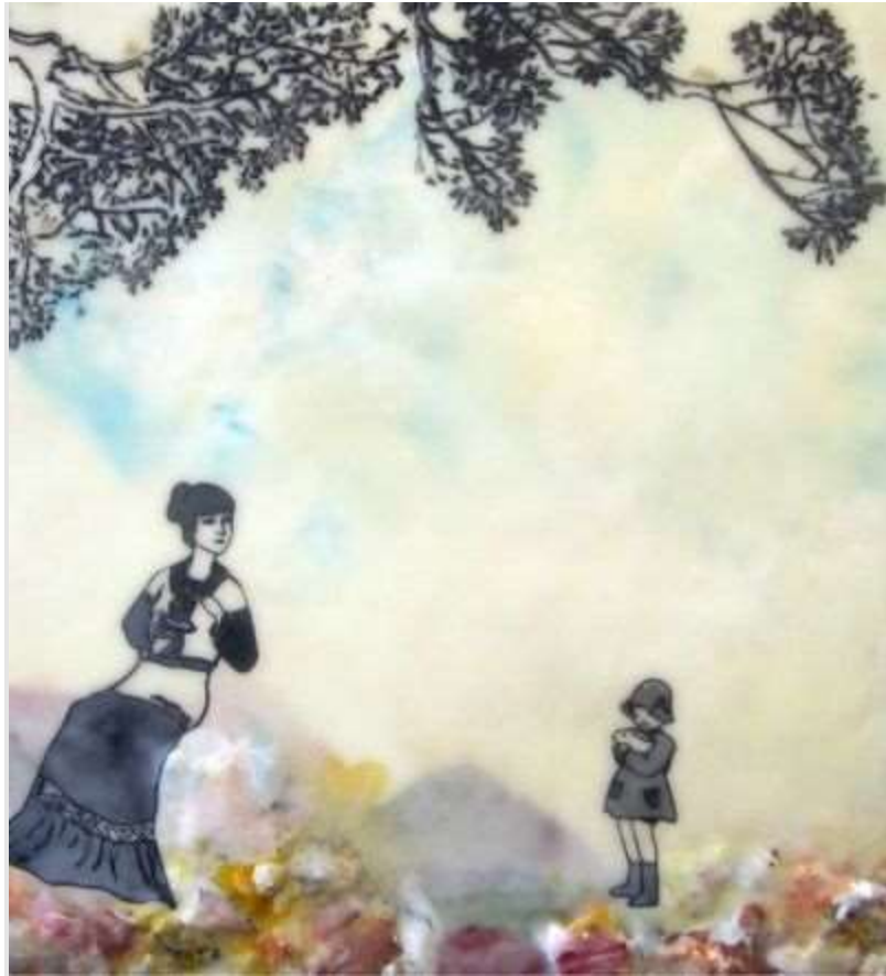
Cecile Chong Open Seating, 2015 Kenise Barnes Fine Art $2,800