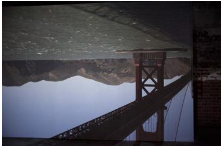
Abelardo Morell. Vertigo , 2012; site-specific double camera obscura using Fort Point windows to reflect an inverted image of the Golden Gate Bridge into the interior space of the East Bastion of the Fort.

Celebrating the seventy-fifth anniversary of the Golden Gate Bridge, International Orange is a public art exhibition like no other. Orchestrated by Cheryl Haines, the executive director of the FOR-SITE Foundation, this project is a product of a partnership between the FOR-SITE Foundation, the Golden Gate National Parks Conservancy, and the National Park Service. The realization of this project is an achievement in itself, and it salutes the Golden Gate Bridge resoundingly. But as an exhibition, International Orange also opens up new domains for the realm of public art.