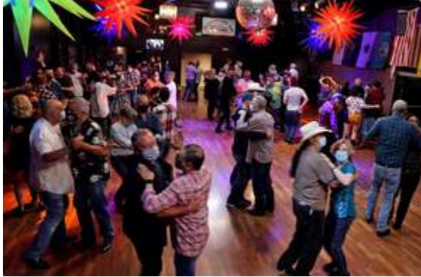
Sundance Saloon @ Space 550