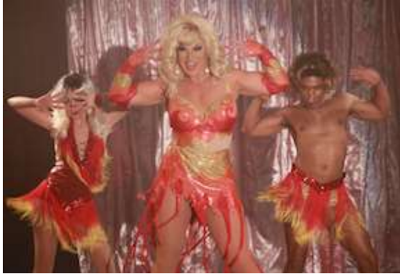
'Shit & Champagne' screening @ Oasis