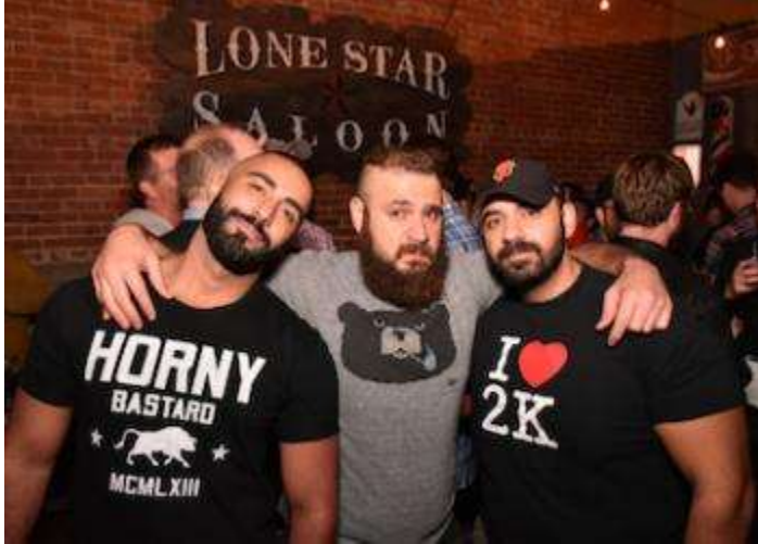
Having a beary good time at The Lone Star Saloon