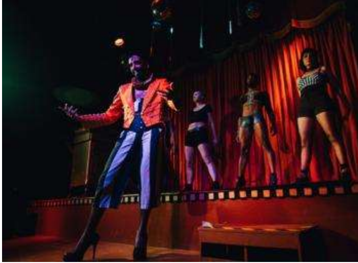
Clutch the Pearls @ Make Out Room