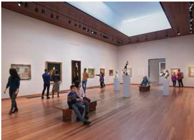
Exhibits @ de Young Museum