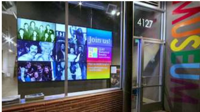
GLBT History Museum, reopened to the public

Book display exhibits on the 6th floor. Also, the James C. Hormel LGBTQIA Center has reopened. 100 Larkin St. https://sfpl.org/