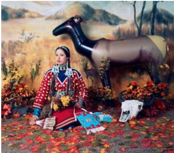
'Constellations: Photographs in Dialogue' @ SF Museum of Modern Art

Magnificent Magnolias are in bloom (thru March) at the beautiful spacious gardens with multiple plants, trees and flowers. Free entry for SF residents; others $3-$10. 1199 9th Ave., Golden Gate Park. https://www.sfbg.org