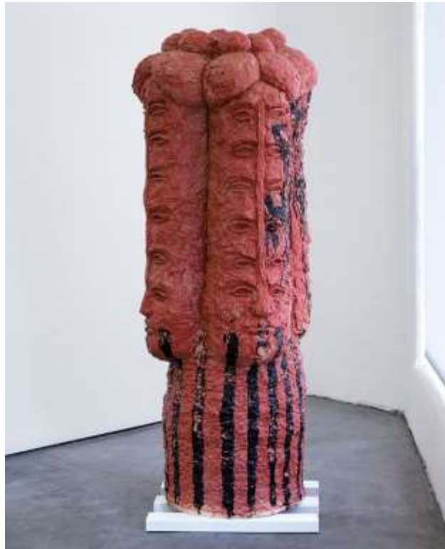
5 Raven Halfmoon's CADDO DANCING IN BINGER, OKLAHOMA, 5 ft. 2 in. (1.6 m) in height, stoneware, glaze, 2019. Courtesy of the artist and Nino Mier Gallery.