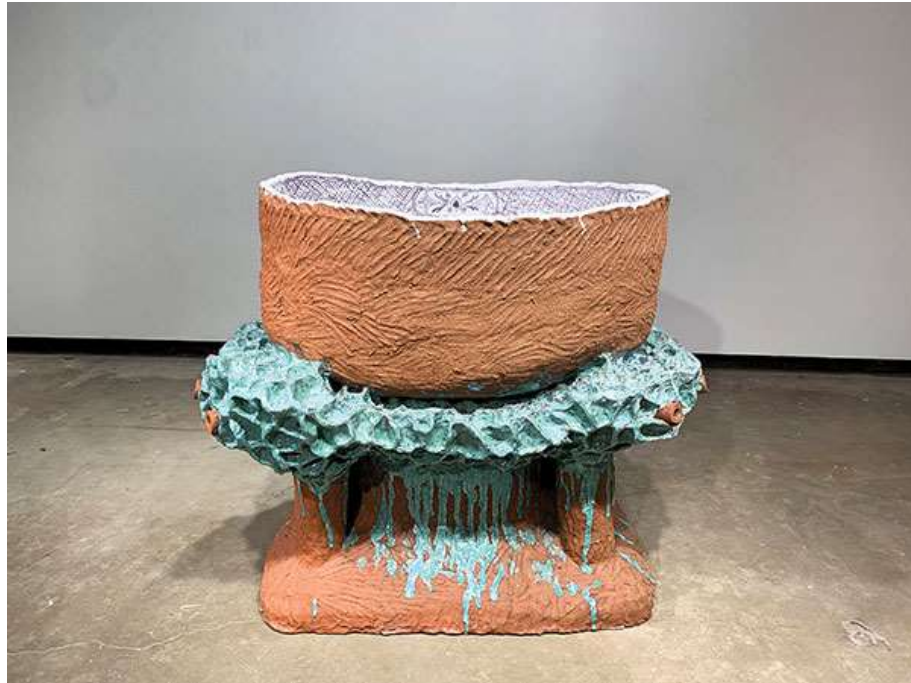
11 Nicki Green's The Porous Sea (Tub) , 4 ft. 3 in. (1.3 m) in height, earthenware, glaze, 2019.

or monster. Jackson's small head, Once More With Feeling , is dark and absurd, bearing a face obscured by a thick, psychedelic glaze. The messy, long-haired wig, snakeskin shirt, and pearl earrings present a campy female being who might be a character in a horror movie. Her Monster Paw series—grotesquely misshapen, oversized hands with manicured, gleaming nails; diseased-looking palms; and hairy skin are a parody of the beckoning female gesture.