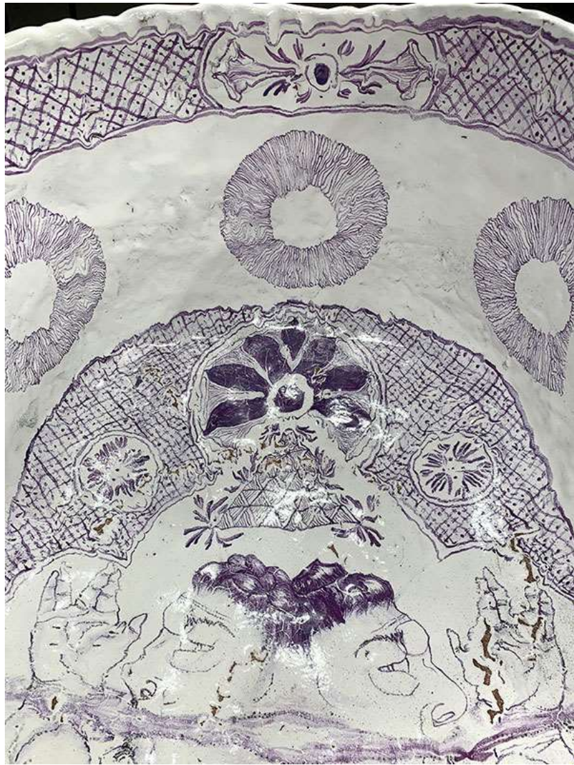
12 Nicki Green's The Porous Sea (Tub) (detail).