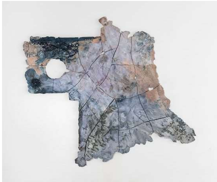
1 Brie Ruais' Topology of a Garden, Southwest, 127 lbs, 6 ft. 5 in. (2 m) in length, pigmented clay, underglaze, hardware, 2018.