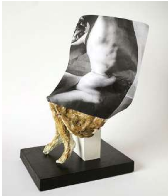
9 Cynthia Lahti's Brown Skirt, 15 in. (38 cm) in height, ceramic, printed found image, archival paper, wood, 2013.