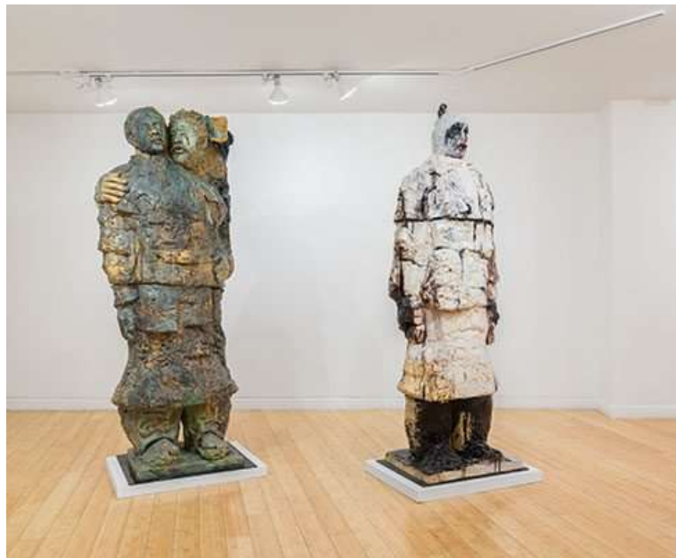
2 Left: Wanxin Zhang's Unbelievable Promise, 6 ft. 2 in. (1.9 m) in height, high-fired stoneware, glazes, 2013. Right: Wanxin Zhang's Special Ambassador, 6 ft. 6 in. (2 m) in height, high-fired stoneware, glazes, 2011.