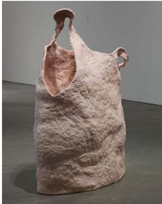
6 Anabel Juarez' Vestigio III, 4 ft. 6 in. (1.4 m) in height, ceramic, glaze.

Brie Ruais and Nicole Seisler utilize clay as an abstract yet factual vehicle, a means of recording time and touch, resistance and disintegration. Both of these artists make process-oriented work using their hands as the sole forming tool. Seisler's participatory red-clay piece Preparing , is a record in the form of multiple pieces of clay, each of which has been wedged 100 times against the wall. The red clay leaves a residue and stains the wall. The pieces of clay have been wedged against the wall in rows so long they extend past the corner of the room. Because of the stain and the wall, Preparing is simultaneously a drawing and a sculpture. Wedging is the start of any project for a ceramic artist and the title is both an observation of the realities of life as a ceramic artist and a pun.