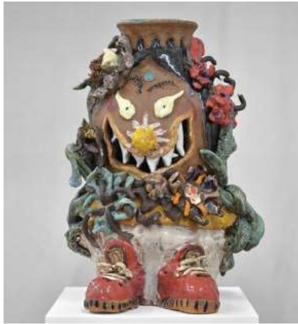
8 Sharif Farrag's Split Face Jar, 17½ in. (44 cm) in height, stoneware, 2019. Courtesy of the artist and François Ghebaly, Los Angeles. Photo: Ethan R. Tate.