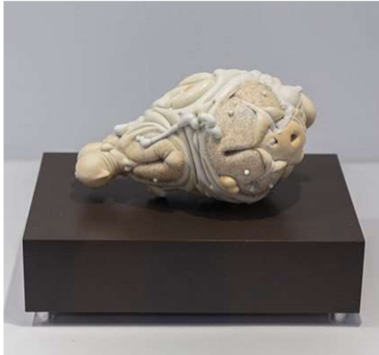
10 Jason Briggs' Blonde , 12 in. (30 cm) in length, porcelain, hair, steel, velvet base, 2010.

Wanxin Zhang was part of the first generation in China to receive a formal art education after the Cultural Revolution ended. Trained in traditional figurative sculpture, he fell under the influence of California Funk when he moved to San Francisco in 1992. He seeks to not only express his personal identity, but also to create a dialog around social and political issues. The two life-sized sculptures, Special Ambassador and Unbelievable Promise , both reference the remains of the Chinese Terracotta Army, Michelangelo's Pieta , and contemporary figures such as Mickey Mouse and Mao Zedong. They clearly reflect Zhang's Chinese heritage. The works are cracked and scarred heavily, textured with marks of tools and fingers, pinching, and carved stamps. The surface is comprised of splashed, dripped, and poured glazes, graffiti-like brush marks, and decals.