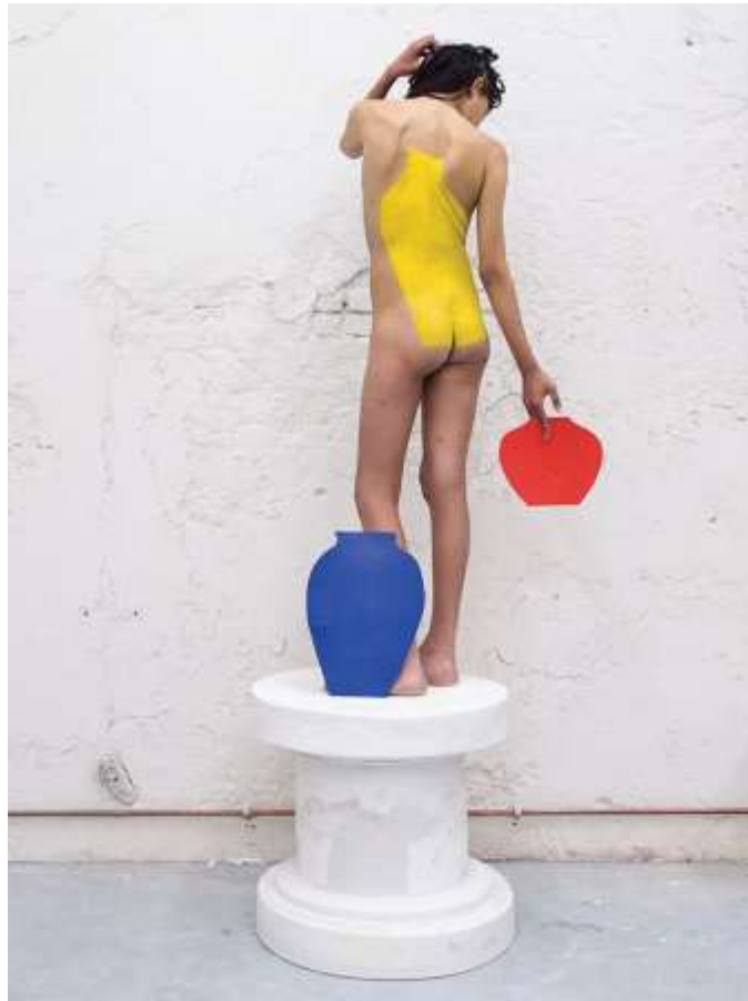
13 Jenny Hata Blumenfield's The Vessel As Female series, variable dimensions, site-specific installation, 2018.

The Body, The Object, The Other provides a varied, inclusive, and dramatic glimpse into some of the best ceramic work being done in the US. It reveals the state of current practices without curatorial theorizing or over-intellectualizing. Perhaps, more to the point, it reveals the significance of ceramics as an important part of contemporary art.