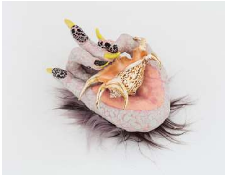
3 Roxanne Jackson's Metal Goddess, 12 in. (30 cm) in length, ceramic, glaze, faux fur, lace, shell, 2017.