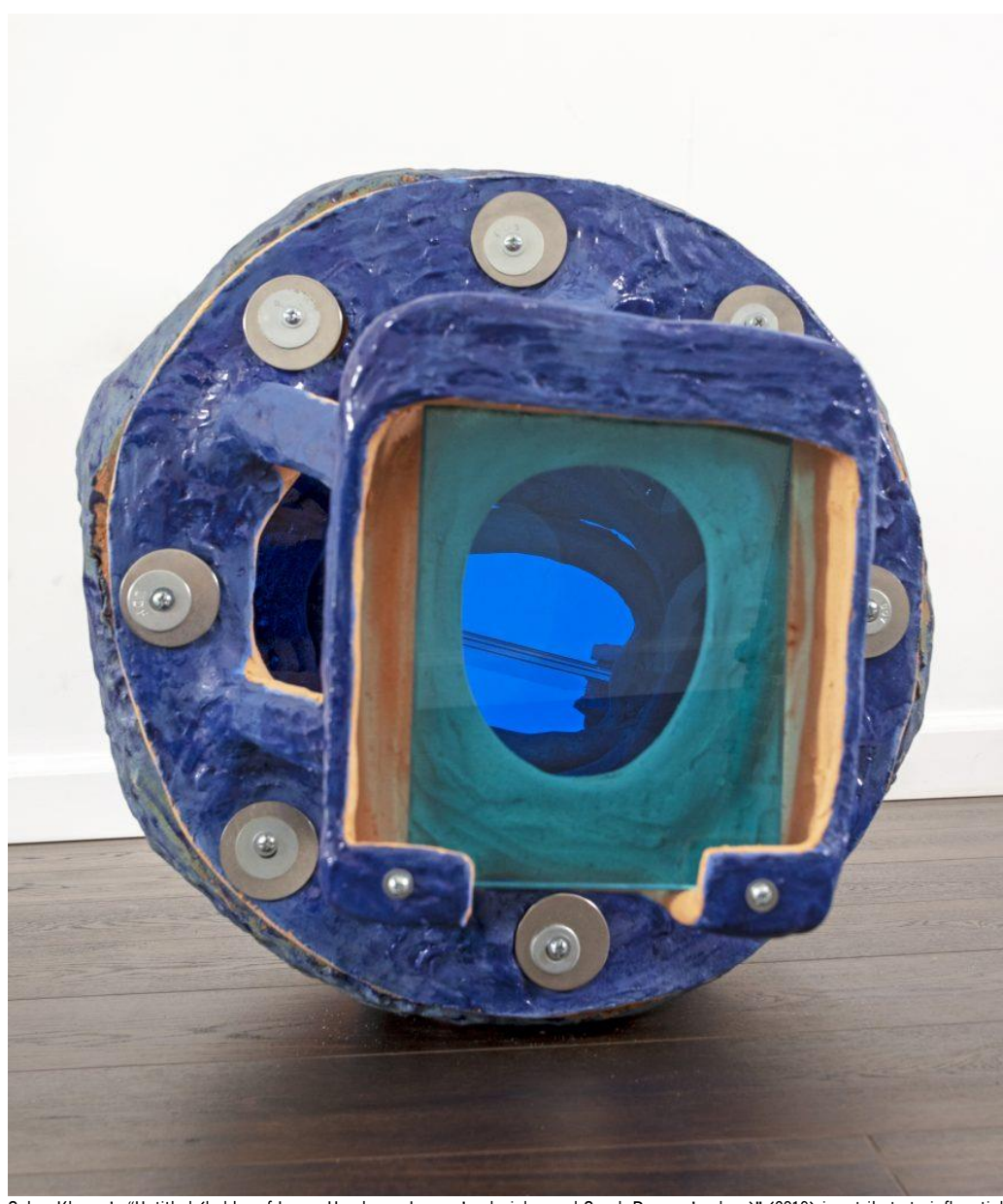
Sahar Khoury's "Untitled (holder of Lynne Hershman Leeson's plexiglas and Sarah Braman's glass)" (2019) is a tribute to influential artists of two generations.

But if her adventurous approach is reminiscent of the free spirit of Voulkos, Khoury's startling mix of media — from leather belts and steel bolts that hold sculptures together, to a ready embrace of humble materials like papier-mâché and cheap plastic — sets her apart from the master. Voulkos and other key ceramics artists of the 1950s and '60s set out to upend convention, but they recognized its boundaries. Khoury is not incrementally revising custom; she simply ignores it.