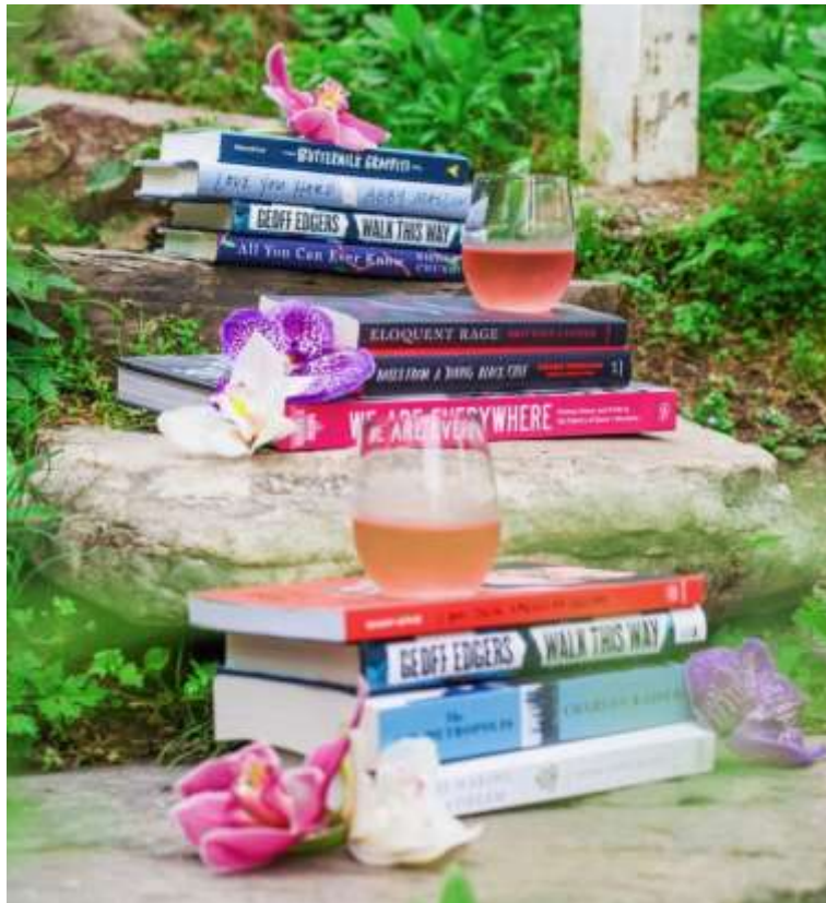
A snapshot from Books in Bloom, 2019.