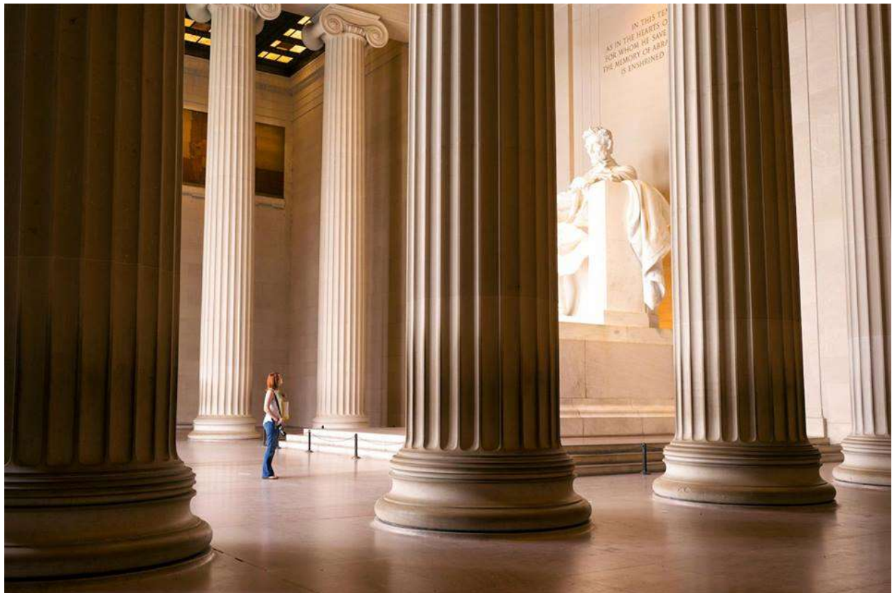
Inside the Lincoln Memorial.

Take the whole family to honor the Lincoln Memorial Centennial this Saturday from 10 a.m.-4 p.m. The National Park Service, Library of Congress, Ford’s Theatre Society, National Archives, Tudor Place and President Lincoln’s Cottage will all be on hand to engage in hands-on activities and connect visitors to the 100-year-old story of the Lincoln Memorial. Kids will be excited to learn they have a chance to earn a Lincoln Memorial Centennial commemorative Junior Ranger badge. More information on the event can be found here .