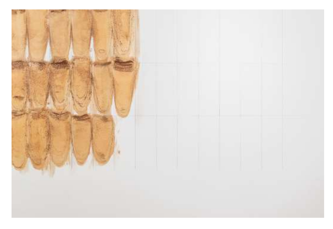
Nicole Seisler, Preparing (detail), 2020. Unfired clay residue, dimensions variable. Courtesy of the artist. Photo: Blake Jacobsen.

On the far wall of the second-floor gallery—a synthetically bright, windowless, lowceilinged space—is a formation of fist-wide, steady smudges, at around shoulder height. Each is slightly tapered, almost ram-like, almost floating, flat but somehow dimensional. The three rows of blood-like smears, or imprints, are too neat and too precise for the timely, wretched image they evoked for me. If a stain could have a voice, this one would be guttural. In my own animal instinct, I saw the marks as animal-like—something like fucking, a wound, a wide, v-shaped stain—until my higher brain conquered with its preferred protective calculation: not blood, but iron; not flesh, but clay. For all of the fleshy things that have been slapped, pressed, shoved, beaten into a wall, in this instance, it was no t a body but a hunk of minerals, rocks, dust. What had happened here? Nicole Seisler's Preparing (2020), an ongoing performance of wedging (pressing, smashing, forcing) this iron-rich clay against an immovable white gallery wall, sucks all the attention from the room. So stark and rude, so flat and light, it is an ethereal rusty ghost in a gallery of looming pedestals subsuming their sculptures.