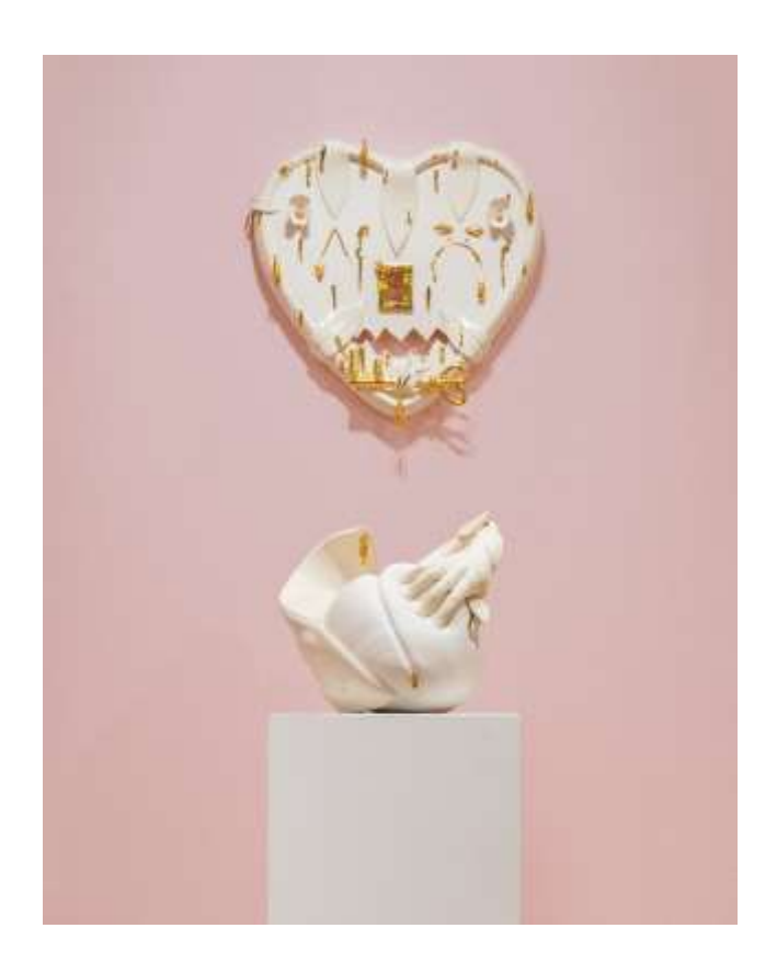
Foreground: Alex Anderson, Excuse Me While I Feel Myself , 2019, earthenware, glaze, and gold luster, 12 1/2 \times 15 \times 8 in. Background: Alex Anderson, Must be Love , 2019, earthenware, glaze, and gold luster, 18 \times 17 \times 2 1/2 in. Installation view, The Body, The Object, The Other , Craft Contemporary, Los Angeles, January 25, 2020–January 10, 2021.

Nearby, two groovy clay vessels are set into cut-outs in a translucent black acrylic box. Not unlike an amphibian bobbing in a tank or wading out into waist-high water, Cammie Staros's Fruits of a Fallen Empire (2019) magically insinuates living things—the fallen object with its yawning or screaming mouth-hole, truncated, perhaps castrated, and prostrate to its gooseneck partner, or master. The acrylic is a welcome visual aberration in both shape, color, and permeability, its hard edges performing a mighty clash with the smooth, almost insect-like vessel bellies. Foregrounded in the title as the scene of a bygone battleground, the global application of the gourd as vessel, as food, as decoration emerges as a stand-in for a bygone body, or body politic. Fruits of a Fallen Empire embraces the sway of narrative, but lets the materials do the poetic waxing. Awkward in form and mysterious in function (though graceful as a space-age gourd cupholder), it yanks time in two different directions. On a cruel day, it could be a prop in a Kubrick film.