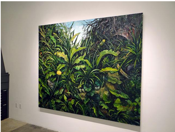
Evidence , 2011; oil on linen; 78 x 94 inches

If you've not yet seen the show, I encourage you to journey into these spaces and embark on the passage of time and experience through which these paintings might lead you.