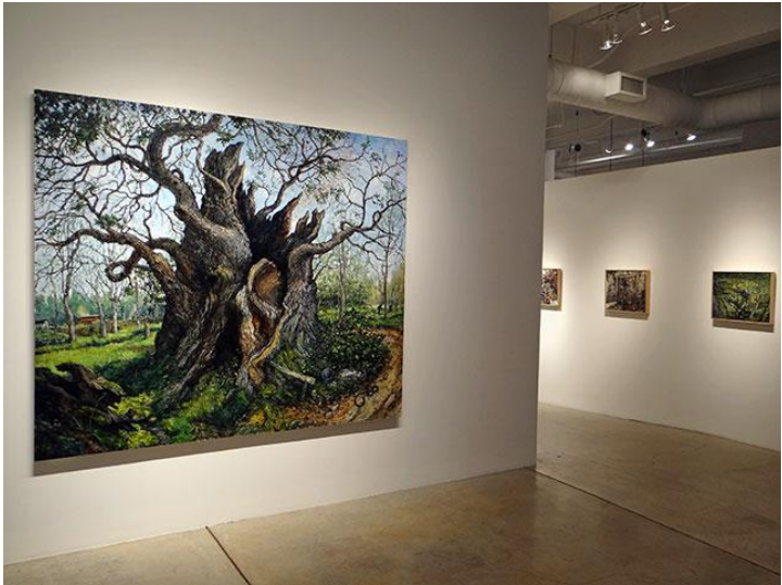
Installation view of Chester Arnold's exhibition A Pilgrim's Progress