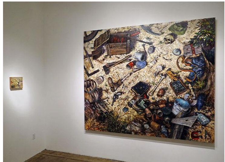
Installation view of Tools of the Trade (2012) and A Game of Bones (2012)

Art by Chester Arnold at Catharine Clark Gallery.