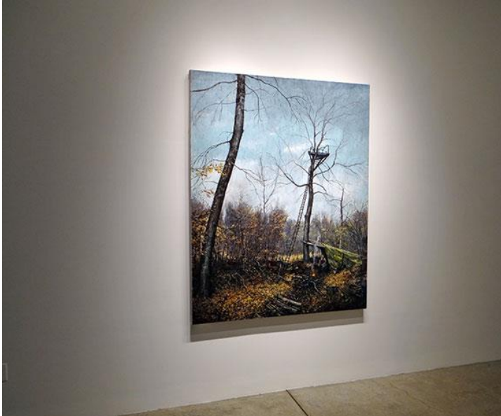
60 Years in the Forest , 2012; Oil on linen; 71 ½ x 56 inches