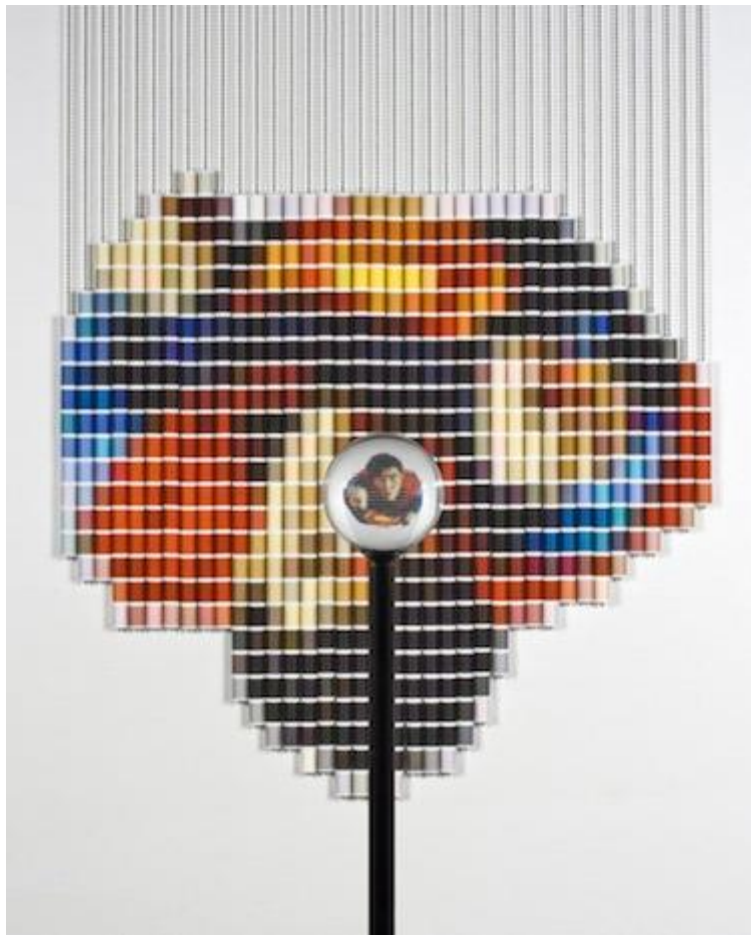
Punch Card, at Catharine Clark Gallery

Thinking Like the Universe runs from January 18 through February 23 at Hatch Gallery , 492 23rd Street, Oakland. Opening Reception: Friday, January 18 from 7 - 9:30 pm