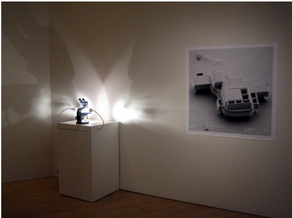
flw by Ken Goldberg and Karl Bohringer. A 1/1 millionth scale model of Frank Lloyd Wright's Fallingwater, fabricated from silicon using ultra high precision lithography. Installed at San Jose Museum of Art, 2006. Image courtesy of the artist.

Art is as deep and as disciplined a field as engineering or science. I have a very strong respect for art's complexities and nuances. To make a contribution in art requires an enormous amount of hard work—experimentation, problem solving, awareness of prior work. All the things that are involved in doing good research in the sciences are also needed to make good art.