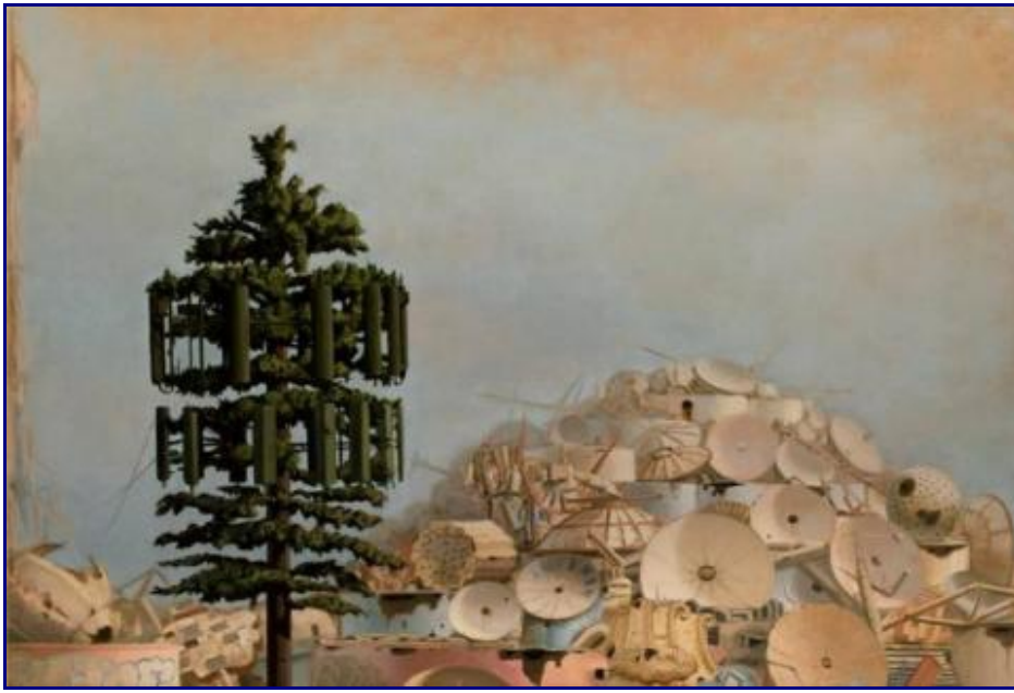
Babel Gone 40"x60", Oil on Canvas on Panel, 2011