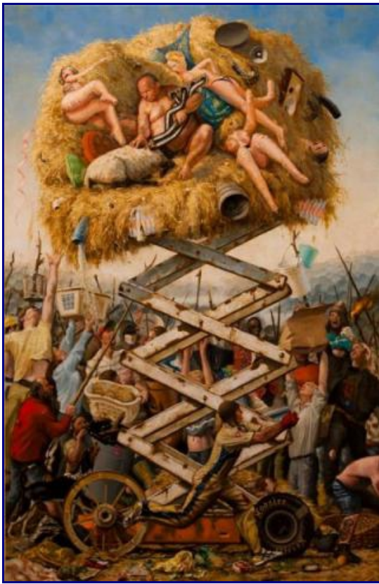
Hay Swagger 54"x36", Oil on Canvas on Panel, 2011