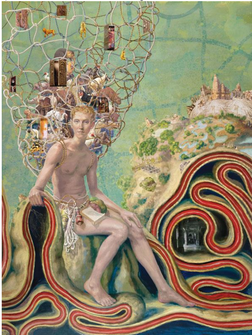
Julie Heffernan, Self-Portrait as Intrepid Scout Leader , 2012, archival pigment print, museum board, glass jewels, metal fittings, gold leaf, PVA glue, acrylic handwork, 36" x 26."