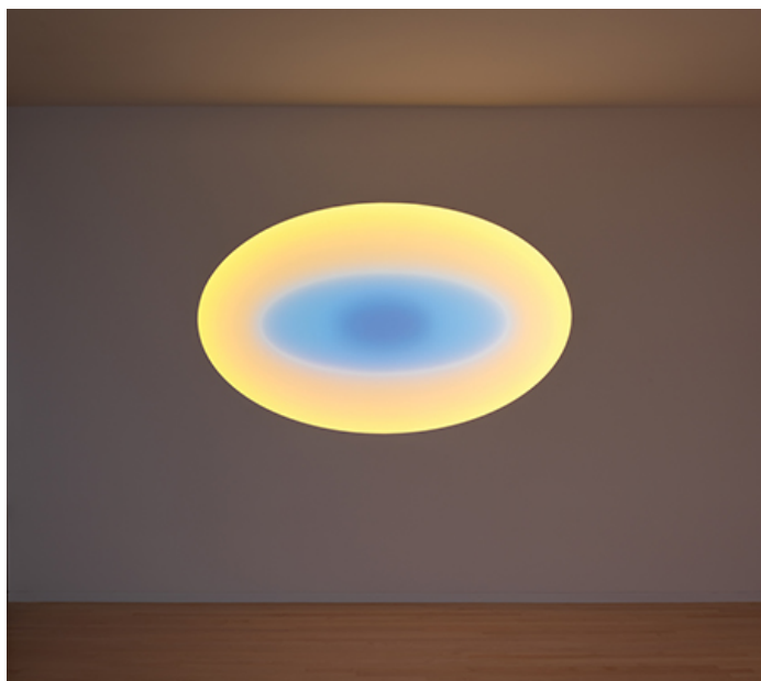
Cape Hope, 2015