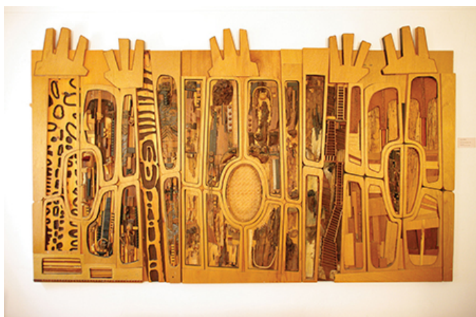
Black, Brown and Biege (After Duke Ellington), 1989

TOP TEN 2015: LOS ANGELES MUSEUMS By George Melrod