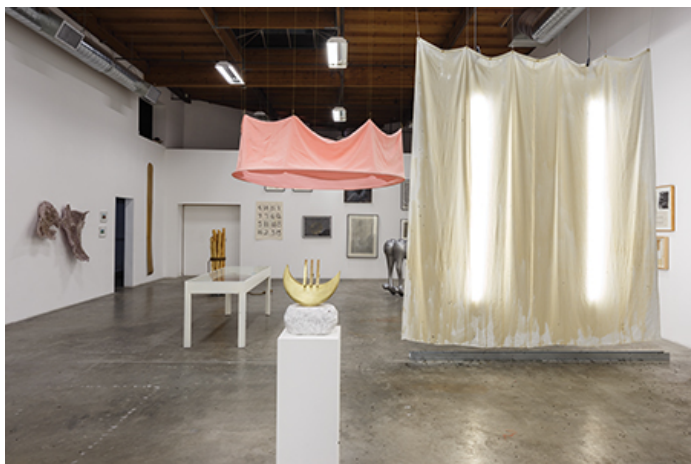
Installation view: Let Power Take A Female Form