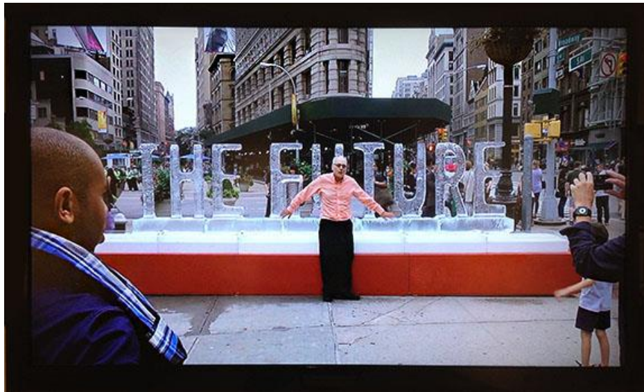
LigoranoReese, Dawn of the Anthropocene, 2014, single-channel video, 4:22.

When conceptual art first reached a mass audience in the late '60s, it shocked by asserting that standalone text could be visual art. Today, text is ingrained in so many types of art (video, installation, drawing, sculpture, painting and photography) that it doesn't elicit so much as a raised eyebrow. Garble , a text-heavy show featuring seven gallery artists doesn't challenge that state of affairs. Instead, by offering a kind of core sampling of current practices, it affirms a key principle of Conceptualism: that ideas, not their delivery systems, are what matter. As for garble itself, there is little; the artists in this exhibition deliver messages that for the most part are quite clear. But if, by using the word garble, the show seeks to demonstrate how artists mess with codes of visual and linguistic communication, well, there's plenty of that going on.