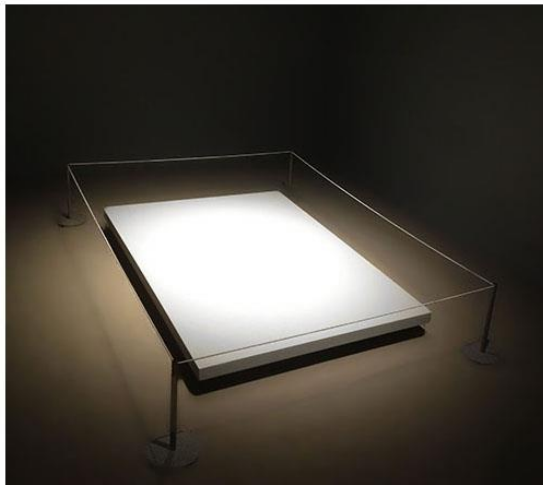
Anthony Discenza, A Sculpture (Reclining Figure) , 2014, audio.

suggestion conspire, and before stupefaction sets in, the canvas at your feet — a literal smackdown of painting — becomes a kind of “screen” onto which we project our own visions of the object described. It’s an elegant demonstration of how and why ideas needn’t be affixed to objects to become concrete. The artist makes that point again with snippets from seven gothic/horror novels, all self-penned and displayed on yellowing paper with foreboding titles ( The Visage , The Tomb , The Goddess Plague ). They, too, light up pictures; only here the effect rests entirely on words, a tribute to sharp writing and to genre parody of a very high order.