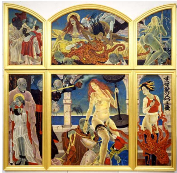
Masami Teraoka, Venus and Pope's Workout , 2004-06 Oil on panel in gold-leaf frame, 119 1/8" x 122 1/2" x 2 3/4" open

Masami Teraoka is widely known for early works that combine the aesthetics of traditional Japanese Edo period woodblock prints, or ukiyo-e , with products and cultural references informed by Western society. Some of his most popular early works feature popular iconography of Western corporate culture such as McDonald's hamburgers, ice cream cones from Baskin Robbins ( 31 Flavors Invading Japan ) and Trojan Gold Coin Condoms in combination with the aesthetics and compositional devices used by Edo era master artists such as Hokusai and Kunisada. His newest paintings expand upon Teraoka's prescient preoccupation with globalism and hypocrisy, and his more recent concerns about American life post 9-11, and the Catholic church sex abuse scandal, through stylistic appropriation of early European Renaissance painting. Not only does he adopt the compositions and palette of Renaissance painting, but he also uses gold-leaf triptych frames to house the multi-panel paintings.