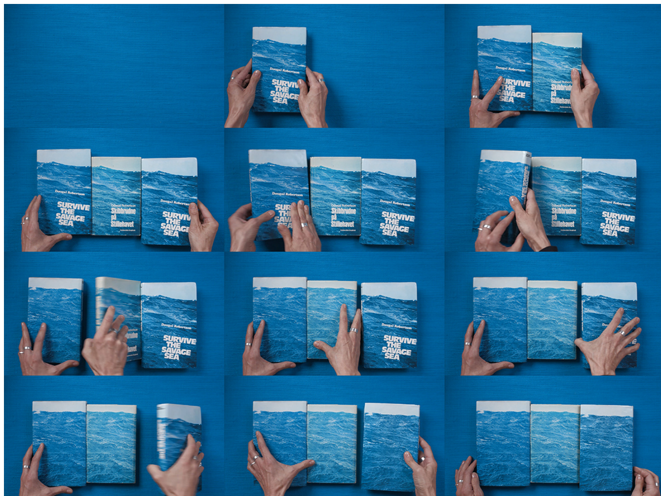
Above: Nina Katchadourian, composite of stills from Orientation Video , 2020; single-channel video with sound.